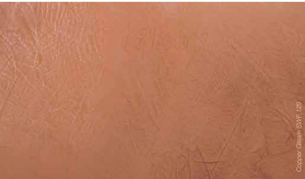
Copper Gleam SWF 129