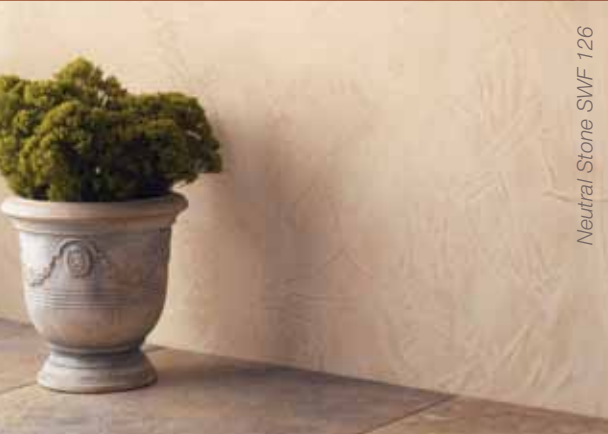
Neutral Stone SWF 126