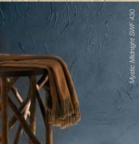
Mystic Midnight SWF 450