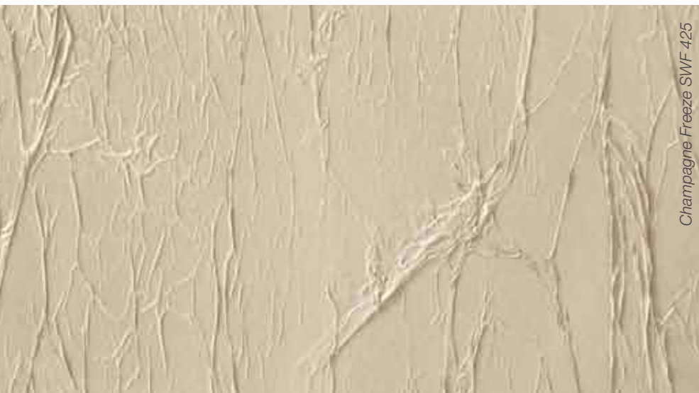
Champagne Freeze SWF 425

Irregular creases and folds created in this technique provide the opportunity to add outstanding interest to any plain surface you'd like to highlight. From afar, the texture is subtle—taking on an appearance of stucco or cement. As you get closer, the unusual personality of the wall emerges as a delightful surprise.